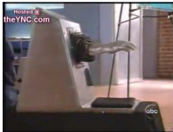
American Inventor Pet Petter